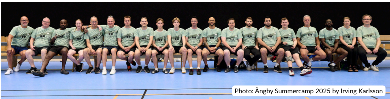
Photo: Ängby Summercamp 2025